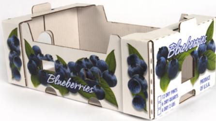
12 Pint / 6 Quart Blueberry Box Shoulder Style Machine Set