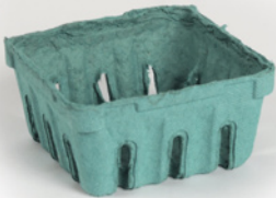
1/2 Pint Pulp Container