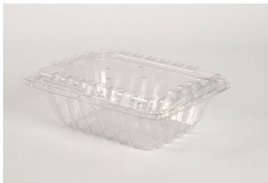
2 Pound Standard Footprint.