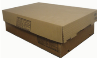
General Purpose Box 25 Pound or 50 Pound Size

We also carry stretch film, stretch net and vegetable wax.