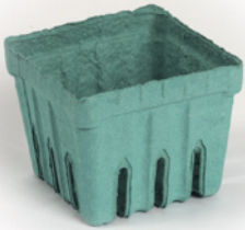
1 Pint Pulp Container