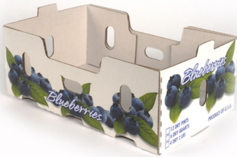
12 Pint / 6 Quart Blueberry Box Open Top Machine Set