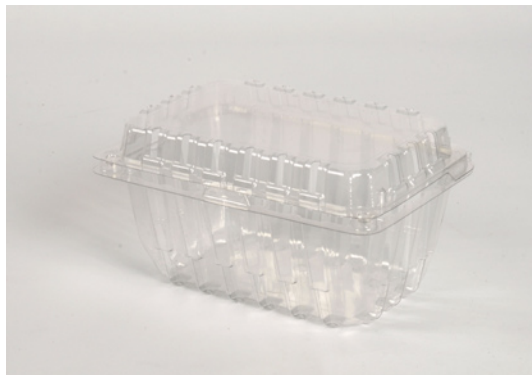
1 Pound Standard Clamshell