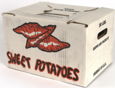
20 Pound Sweet Potato Box