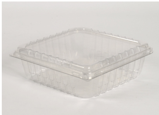
24 Ounce Modular Blueberry clamshell

We provide label application to all size clamshells. You can supply the label, or we can design one for you!