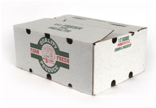
Waxed 1/2 Bushel Box