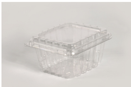
1 Pint Standard Clamshell