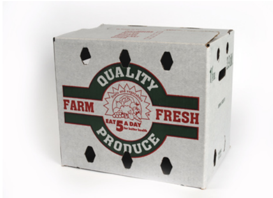
Unwaxed 1 1/9 Bushel Box