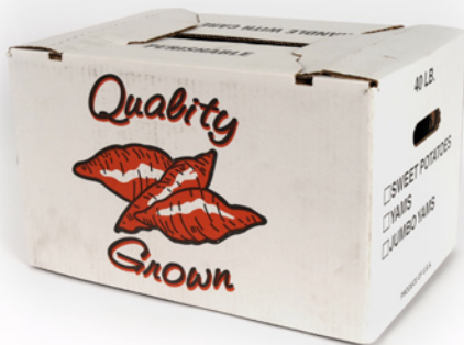
40 Pound Sweet Potato Box