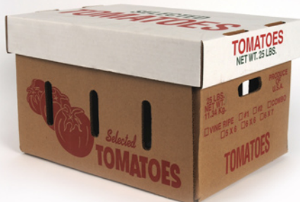
25 Pound Tomato Box