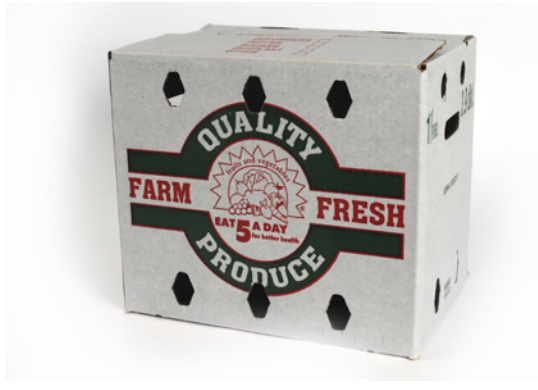
Waxed 1 1/9 Bushel Box