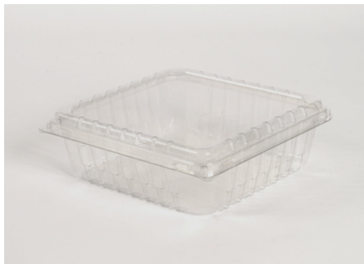
2 Pound Modular Clamshell