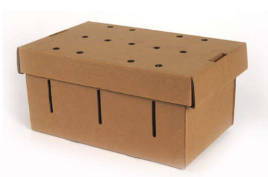
10 Pound Blueberry Box