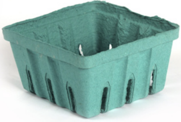
1 Quart Pulp Container