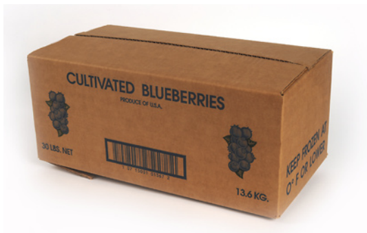
30 Pound Blueberry Box