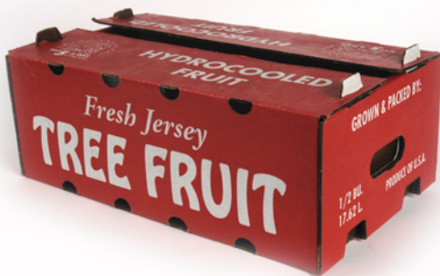
25 Pound Tree Fruit Box