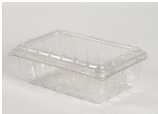
18 Ounce Clamshell