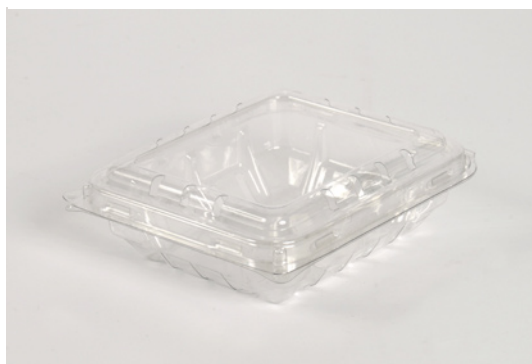
6 Ounce Clamshell