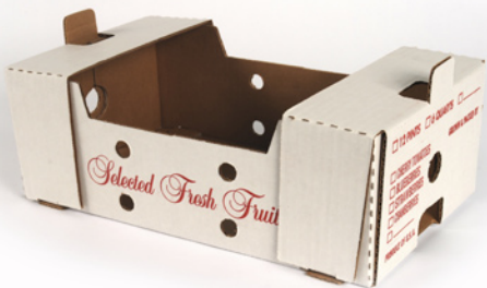
12 Pint / 6 Quart Master Box