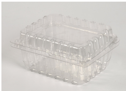
1 Pound Strawberry Modular Clamshell