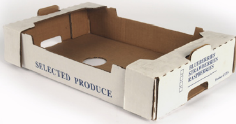
6 Pint / 12 Half-Pint Box