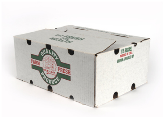
Unwaxed 1/2 Bushel Box