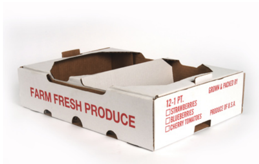
12 Pint Flat 8 Quart Flats also available